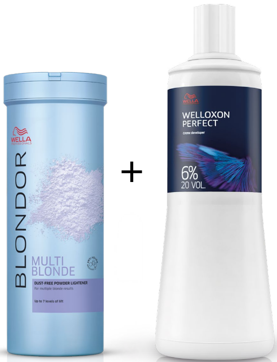
Highlights & Balayage

30g 60g 30g 60g 2g 30g 60g 2g Multi Blonde 6% 7/71 1.9% Nº1 10/81 1.9% Nº1 Powder