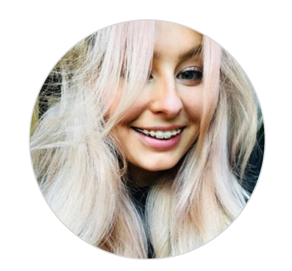
By Ebba Eliassoon @ebba.wella