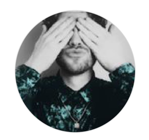
By Tom Badger @tombadgerhair