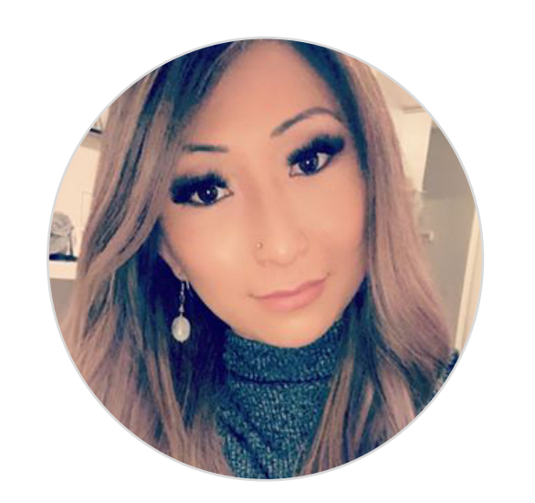
By Kanako @hairbykanako