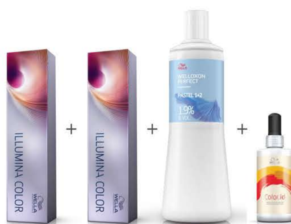
ROOTS AND ENDS